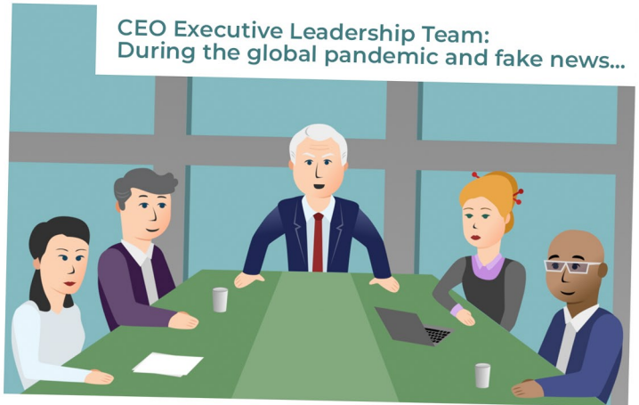
CEO Executive Leadership Team: During the global pandemic and fake news...